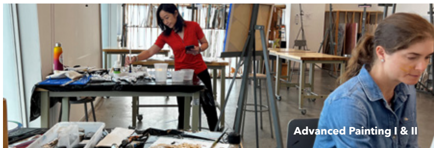
Advanced Painting I & II