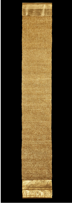
Olga de Amaral, Tabla 28 (Slate 28) , 2012, linen, gesso, acrylic, and gold leaf.

This exhibition is organized by the Museum of Fine Arts, Houston, and the Cranbrook Art Museum.