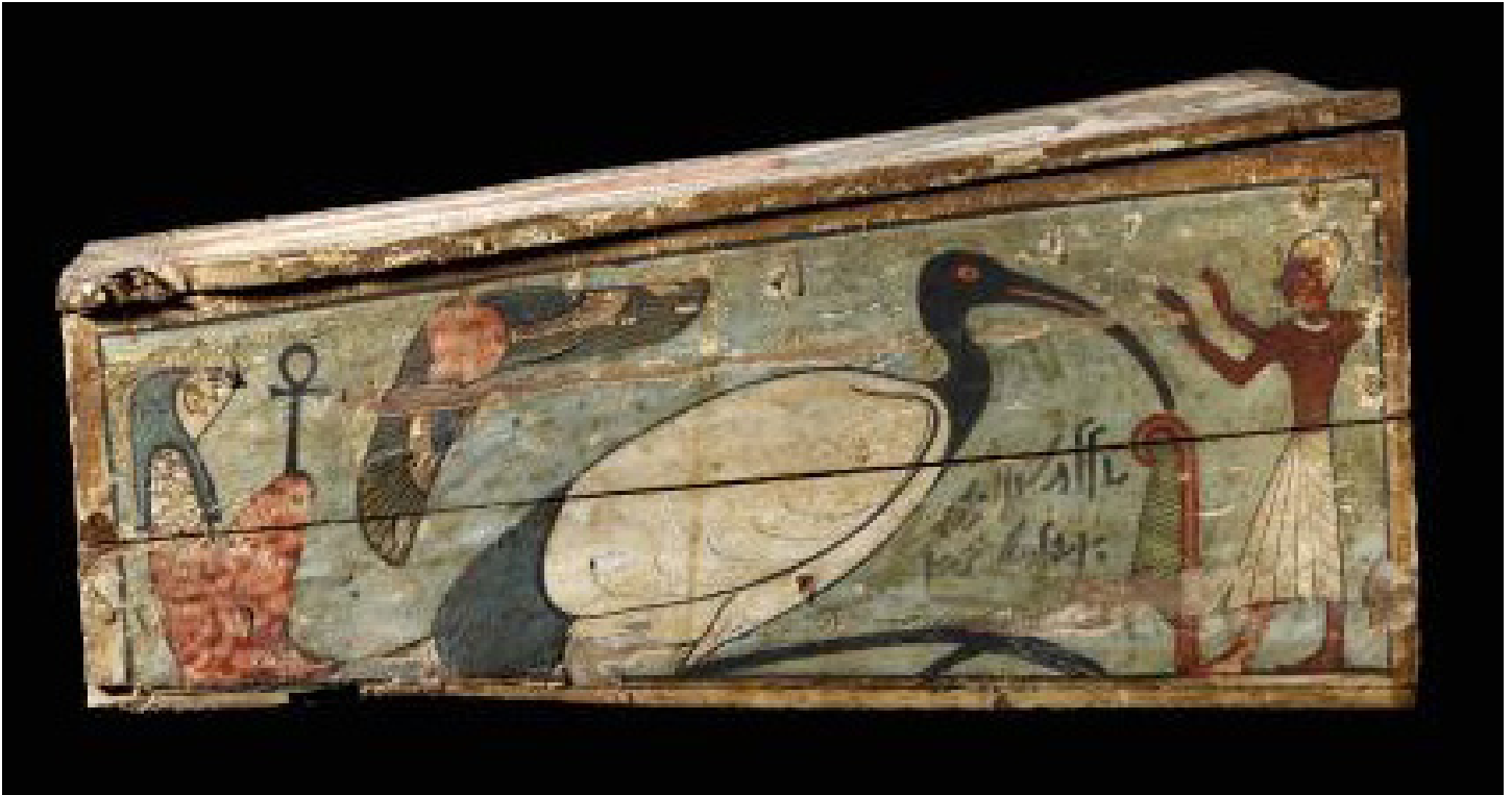
Egyptian, Painted Wooden Coffin of the Sacred Ibis of Thoth , 332–30 BC, wood with polychrome decoration, the Museum of Fine Arts, Houston, museum purchase funded by Isabel Brown Wilson and The Brown Foundation, Inc., 2008.808.

Find and circle all the ancient Egyptian symbols in the object.