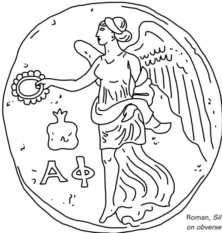
Roman, Silver Tetradrachm with Corinthian-style Athena on obverse and Nike on reverse, 225–175 BC